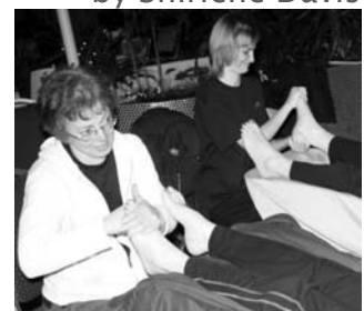
Myotherapy College Benevolent Fund Student Fundraiser