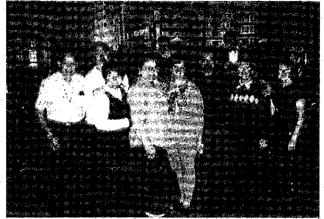
Utah Chapter members at AMTA National Convention

VIII. ACTION-Deadline for National Standing Rules changes are due by March 1, 2002